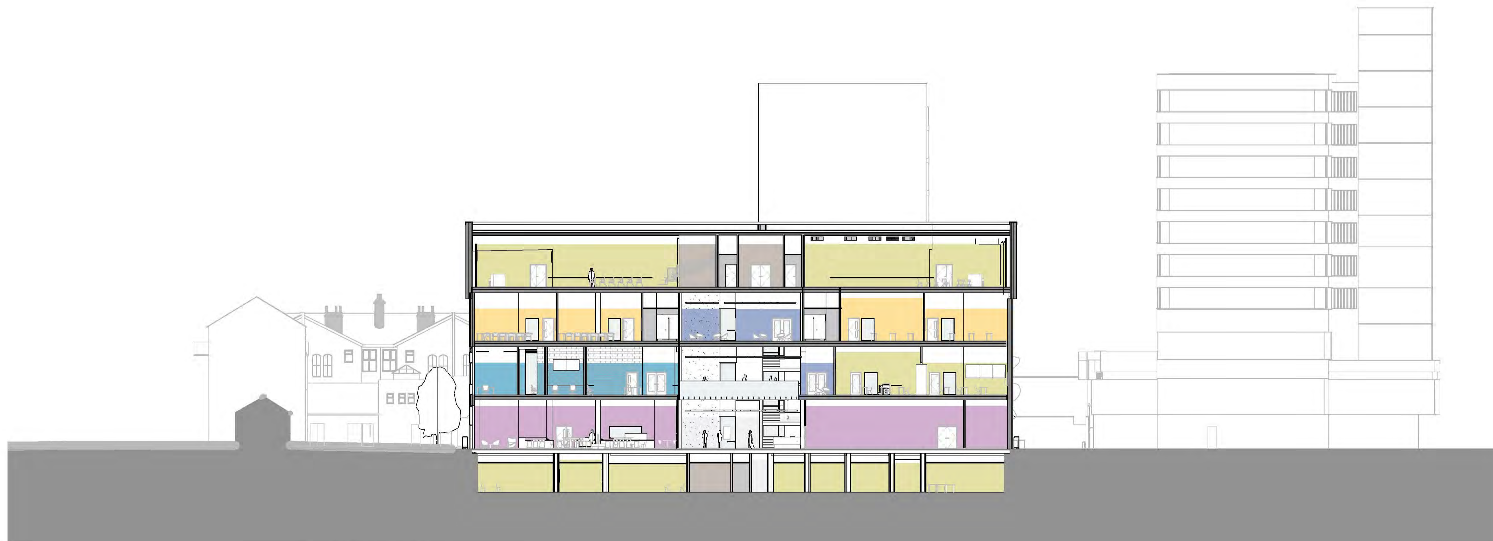
2 SITE SECTION B 1 : 200