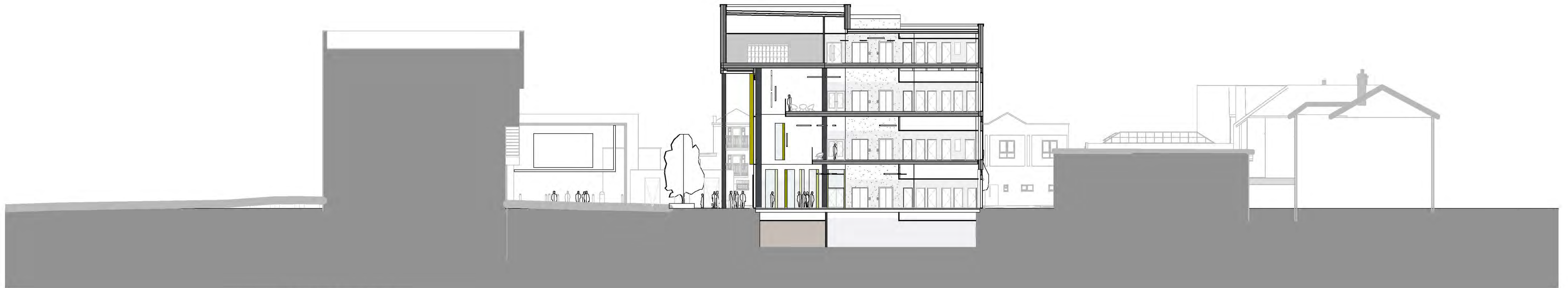
1 SITE SECTION A 1 : 200